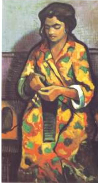
Fig. 13 @mth