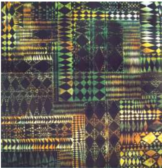
Fig. 18 @mth