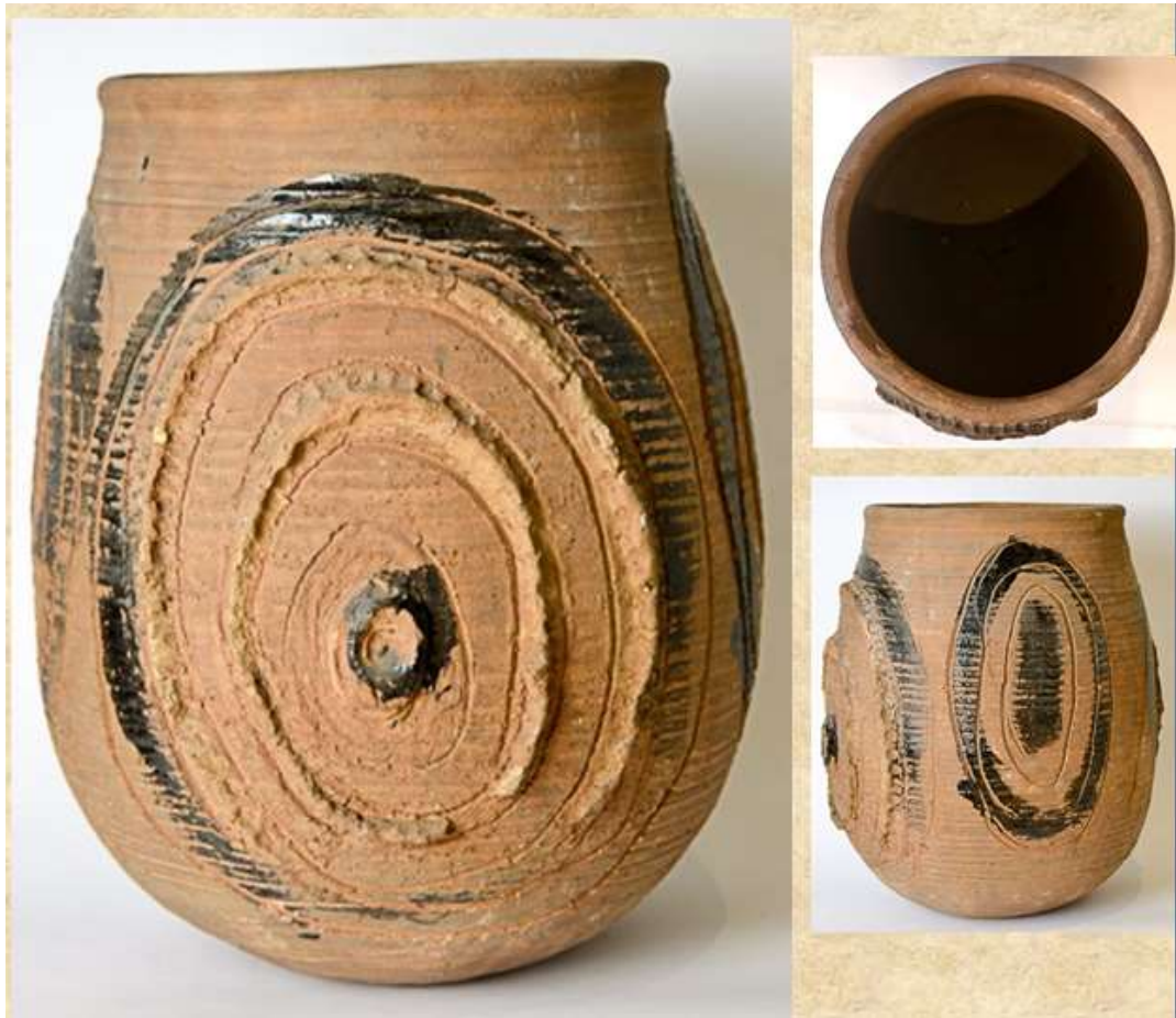
Fig. 7. Untitled, Stoneware ceramic, H. 50 x w. 45 x Ø. 37 cm, 1980. Museum of Modern Art, Cairo Digitized Archive Code: mohamedtaha- POT-6-045 Unregistered