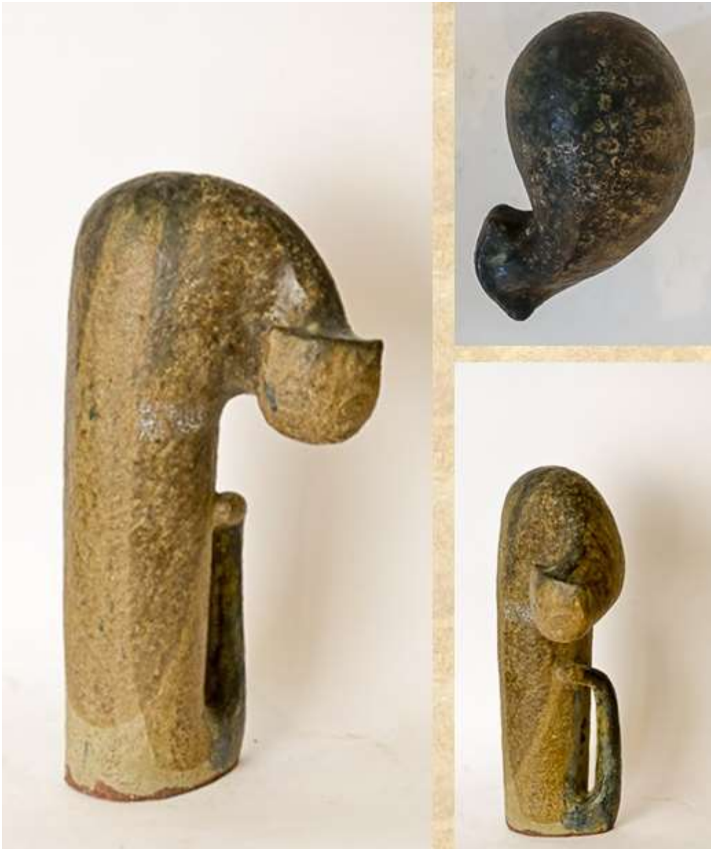
Fig.2. Cat,1958, Stoneware ceramic, H. 41 x w. 25 cm, Museum of Modern Art, Cairo (no.5922)

Digitized Archive Code: mohamedtaha-SO-3-007 5922