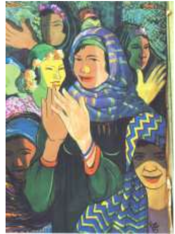
Fig. 14 @mth