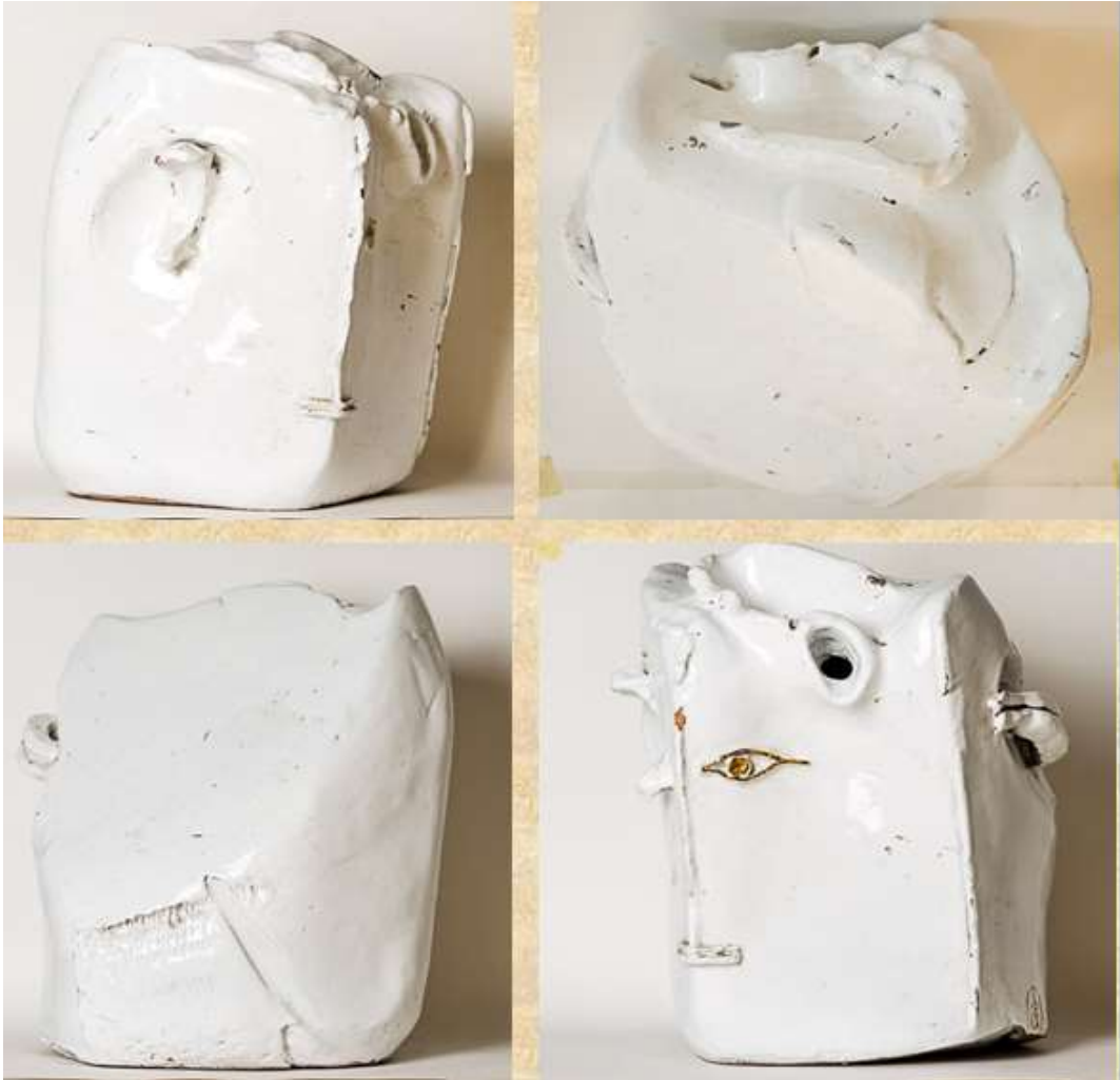
Fig. 11. Untitled, White glazed ceramic, H. 50 x w. 42 x Ø. 46 cm, 1985.