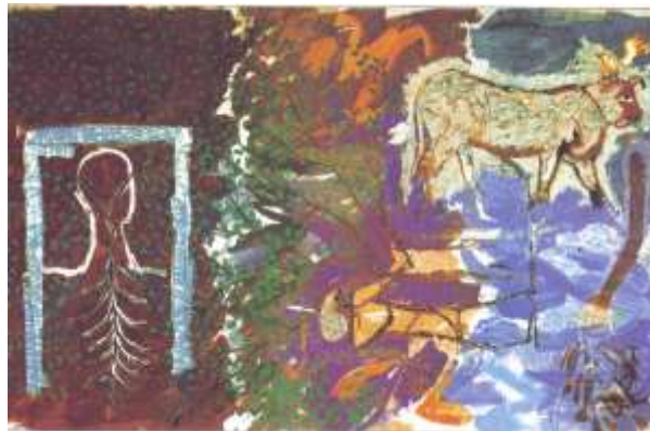
Fig. 24 @mth