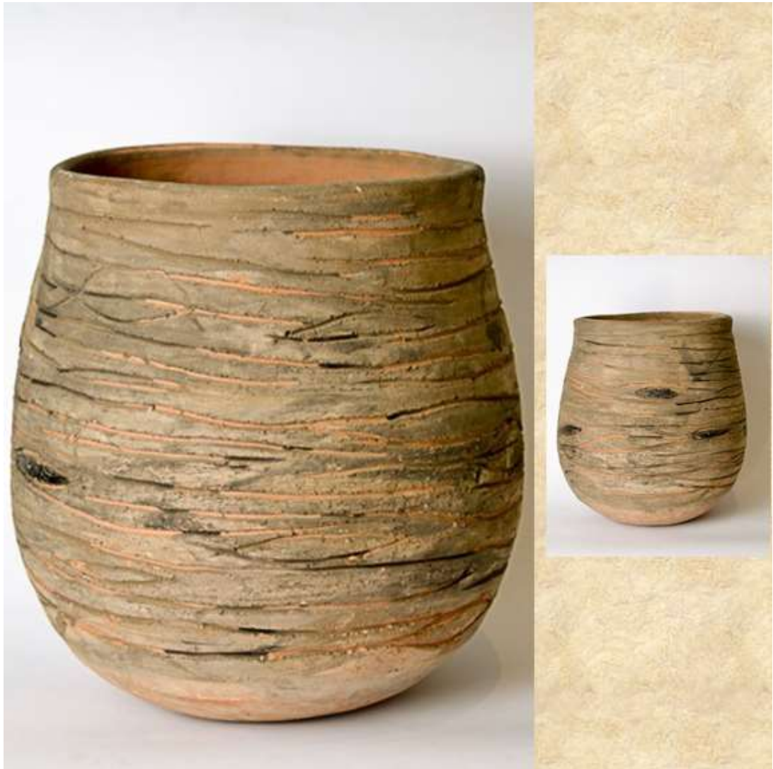
Fig. 6. Untitled. Stoneware ceramic, H. 43 x W. 33 x Ø. 36 cm, 1980. Museum of Modern Art, Cairo Digitized Archive Code: mohamedtaha-POT-6-044 Unregistered