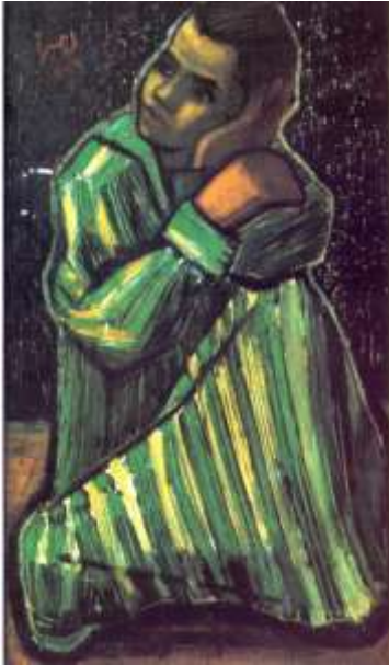
Fig. 12 @mth