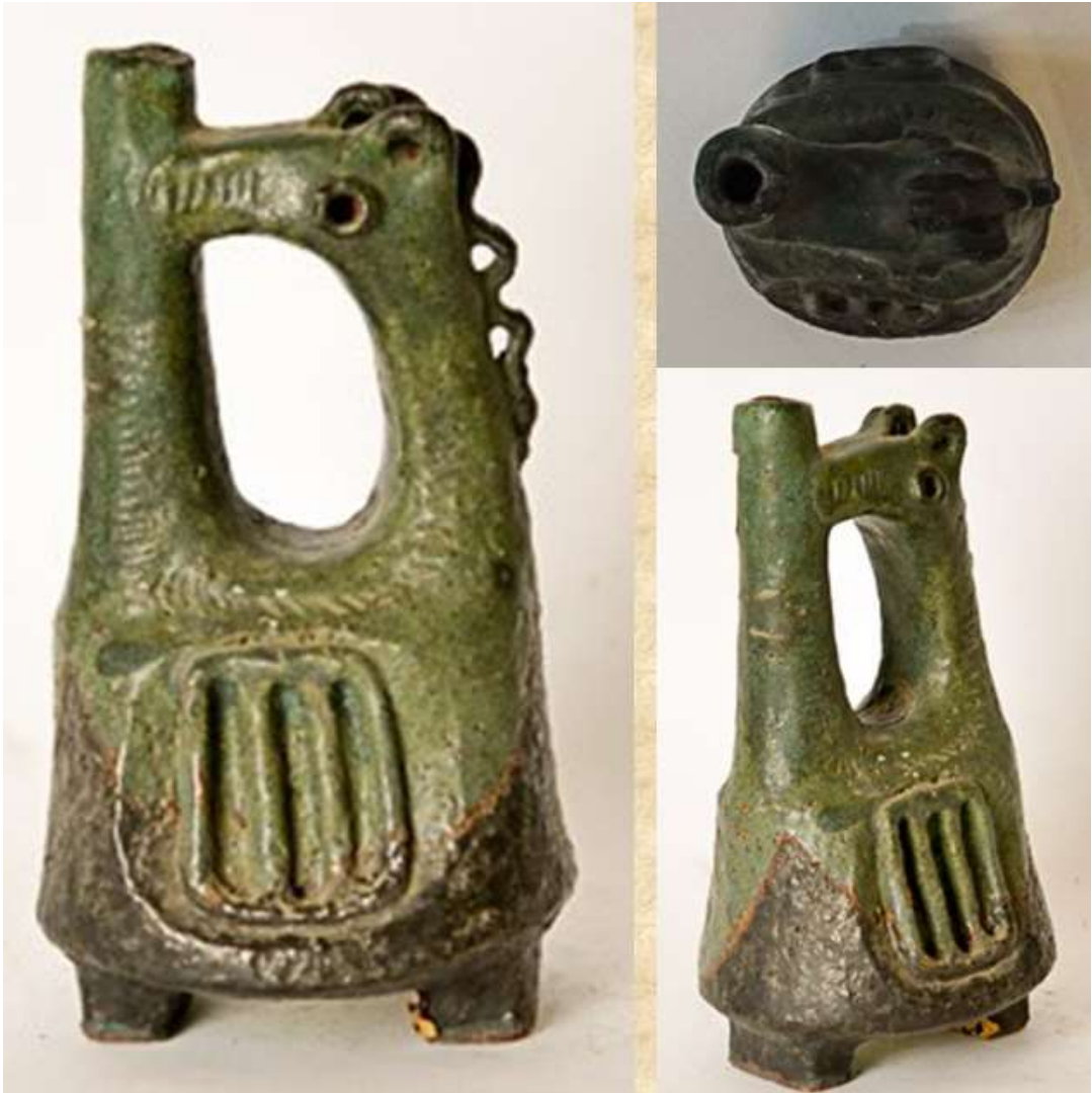
Fig. (1) Horse,1958, Stoneware with engobe and glaze, H. 25 x W. 13.5 cm, Museum of Modern Egyptian Art, (no.6175) Digitized Archive Code: mohamedtaha-POT-3-006B 6175